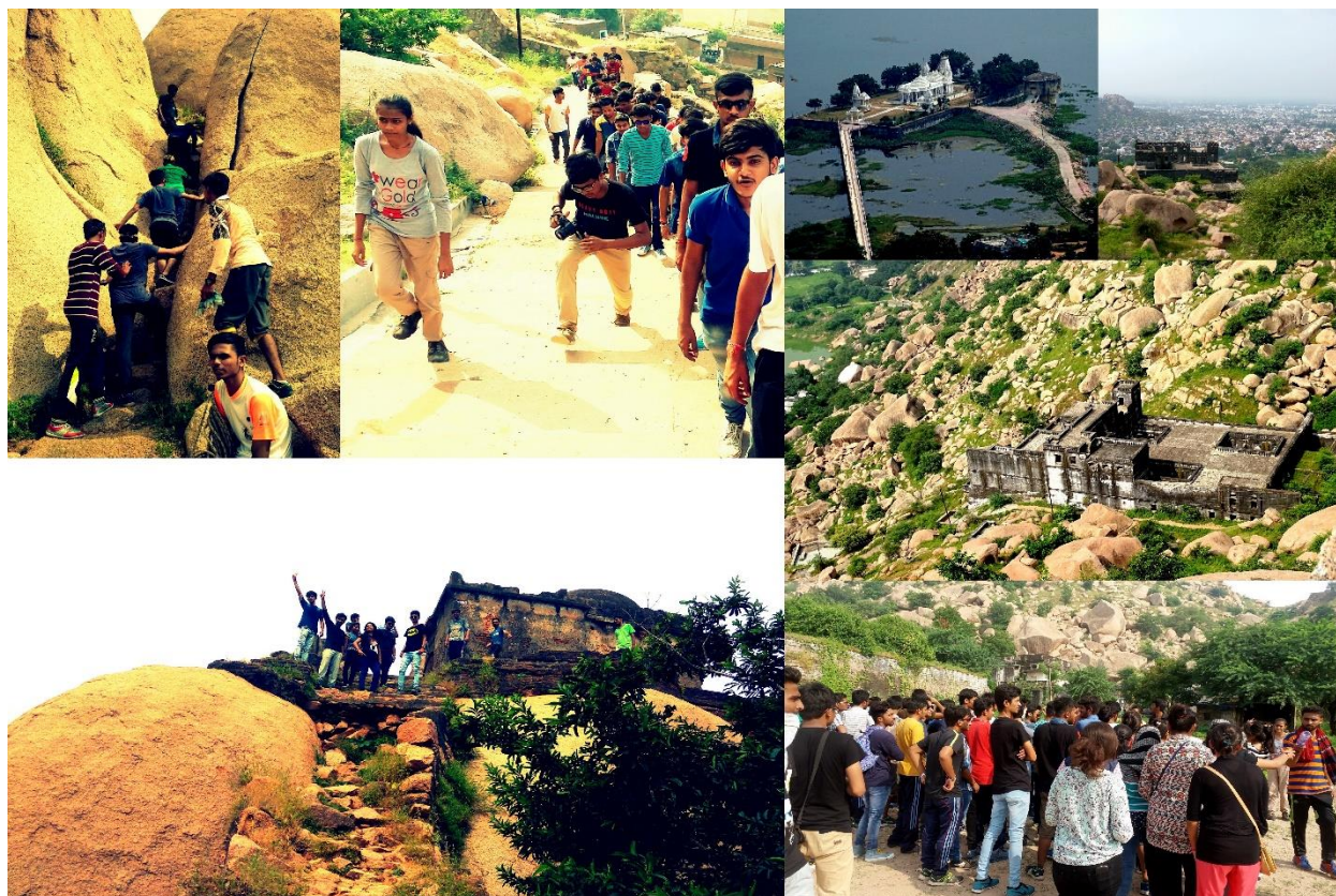
“The memories of chasing their destination- Idariyogadh”