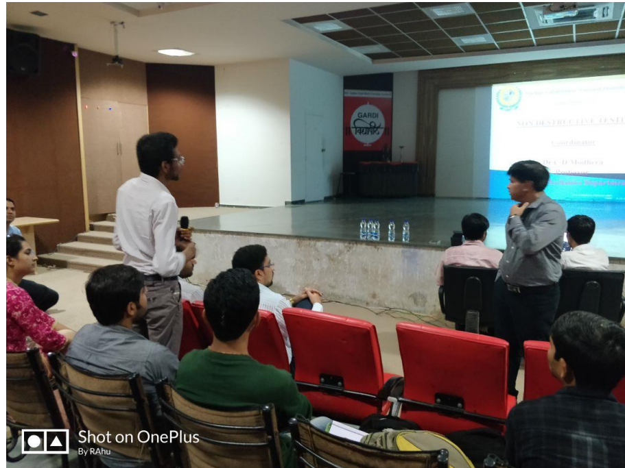
"Memories of Event"