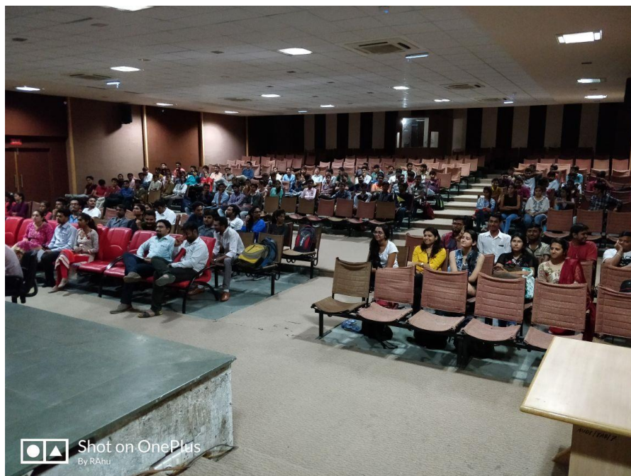
"Bird view of Expert session"