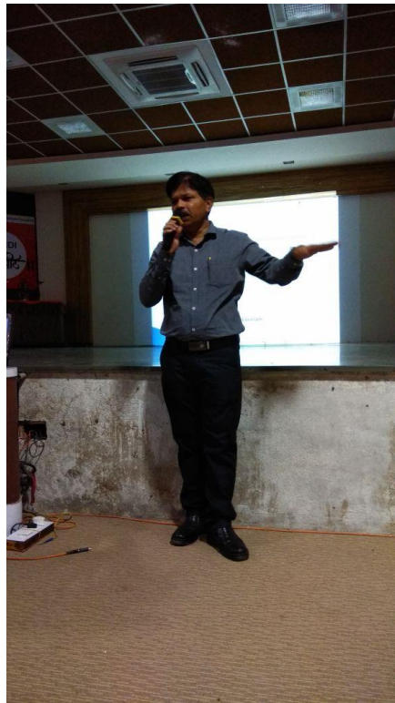
"Glimpses of event"