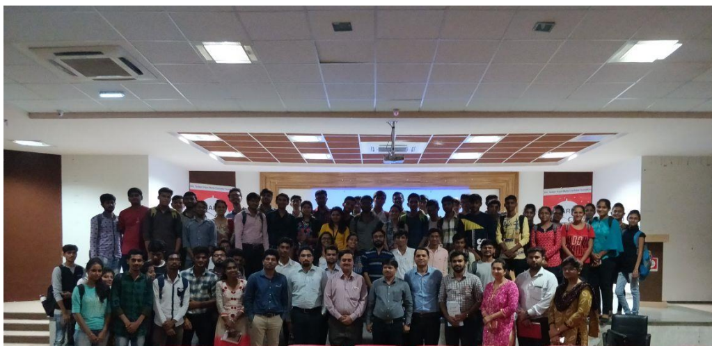
“Ending ceremony “Memory with Expert”